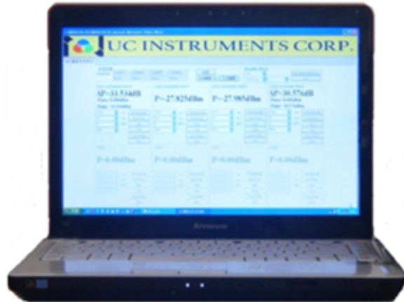
GM82011P4-PC 4-CHANNEL OPTICAL MULTIPOINT POWER METER SYSTEM GM82011P8-PC 8-CHANNEL OPTICAL MULTIPOINT POWER METER SYSTEM